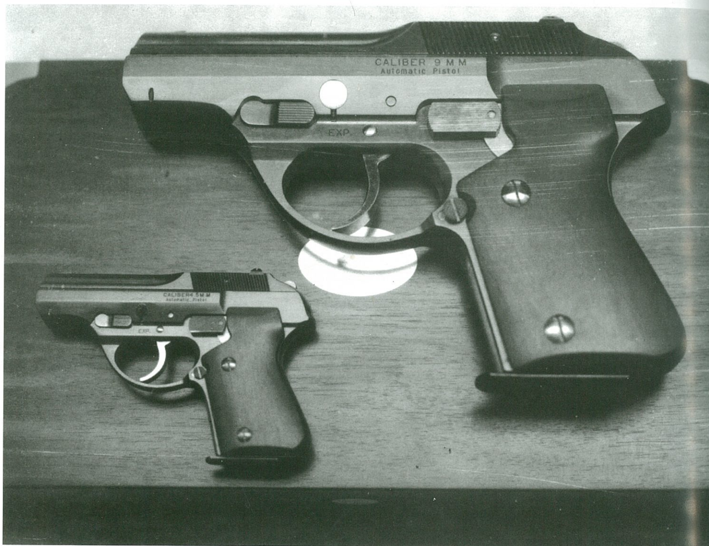
Norton DP-75's resting on lid of custom Macassar wood case.