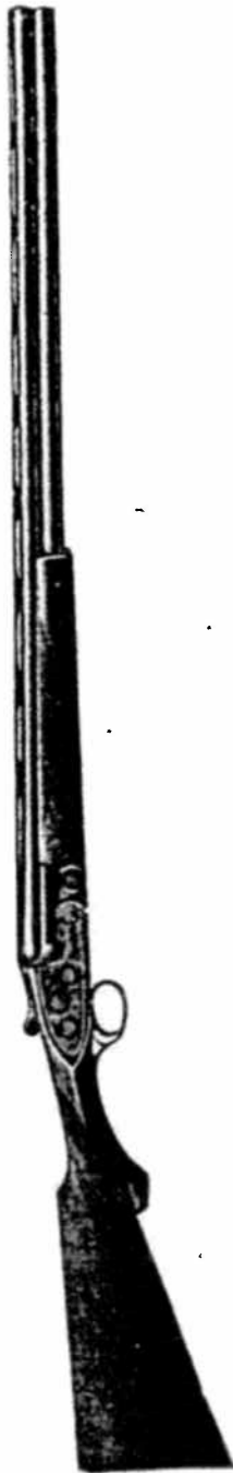
Over and Under Type

The same advantages that are inherent in the regular side-by-side barrel models of Woodward guns, are incorporated in the "Under and Over" or vertical barrel guns, which is notable in that a system has been worked out whereby the barrels are absolutely prevented from working loose in action. Thus the well known advantages of this type of gun are gained without losing the solidity and dependability of the other type.