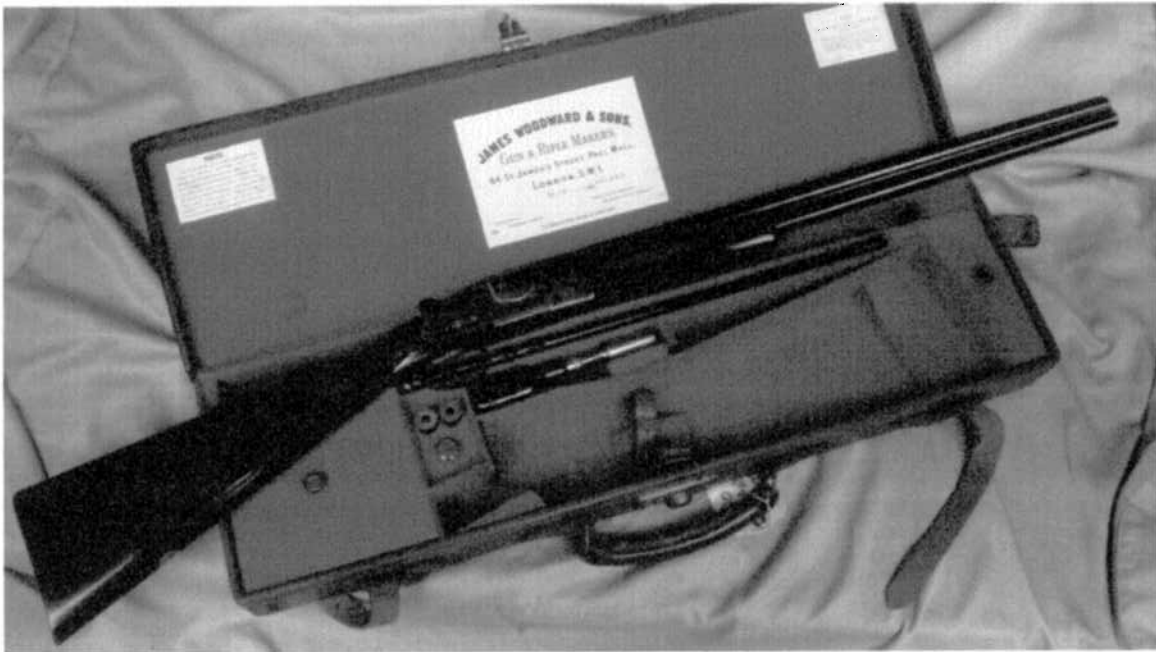
Woodward 7076 – reproduced with permission of Osprey Arms

Woodward Best Over/Under Shotgun Serial No. 7076