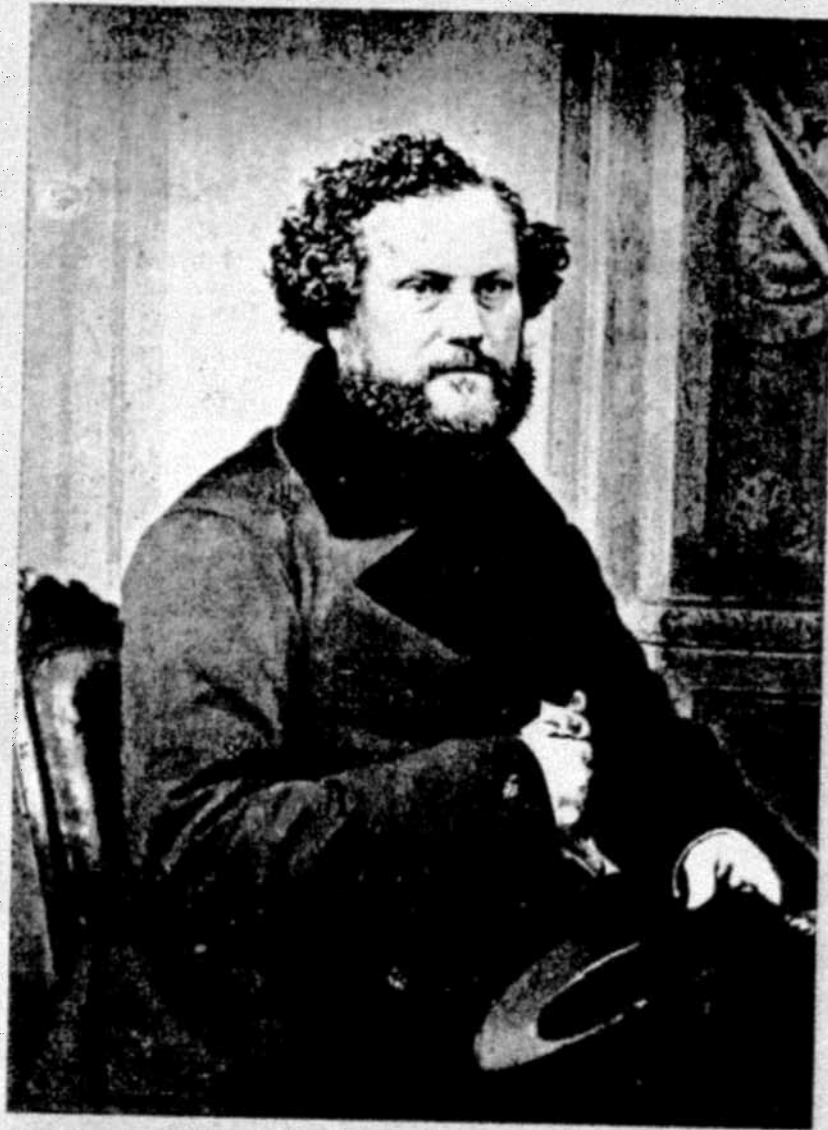
Samuel Colt 1814-1862