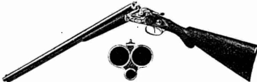
GREIFELT THREE-BARREL GUN