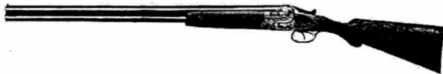
GRADE NO. 1—GREIFELT OVER AND UNDER WITH SOLID MATTED RIB