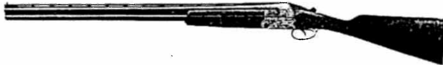
GRADE NO. 1—GREIFELT OVER AND UNDER WITH VENTILATED RIB