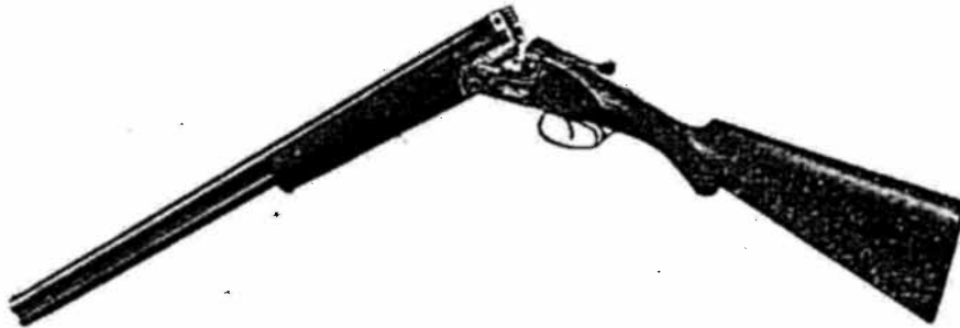
GRADE NO. 2—GREIFELT OVER AND UNDER WITH SOLID MATTED RIB