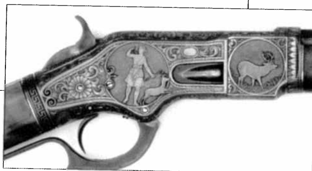
Gift of Olin Corporation, Winchester Arms Collection 1988.8.3283