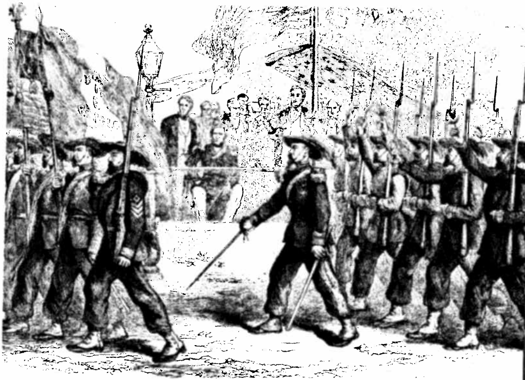
The Garibaldi Guard march past President Lincoln in 1861 at the time of mobilization of the Union troops. The colour party, with 1st Sergeants as Colour Guard, carry the Union National Flag, the official Regimental Flag, and (nearest) their own independent non-official flag based on Italian national colours.