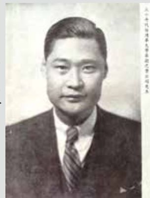
Ye Gongchao in the 1930s, professor at Tsinghua University

Ye Gongchao (George Kung-chao Yeh, 1904-1981) was the former Foreign Minister of the Chinese Nationalist Government on the mainland and later in Taiwan (1950-1958) and Ambassador to the US (1958-1961). Born into a high-ranking literati family in Canton, Ye moved to the United States at an early age and attended Amherst College. According to his obituaries on the New York Times , during his study in the US, Ye's poetic talents attracted the attention of Robert Frost. After graduation in 1924, Ye went to Cambridge University to study for a master's degree under the tutelage of T.S. Eliot. Upon returning to China, at age twenty-two, Ye became professor in English literature in Peking University and later in Tsinghua University. He assumed many diplomatic posts before serving as the Minister of Foreign Affairs for eight years. In 1958, Ye was appointed as the Ambassador to the U.S. and was recalled to Taiwan in 1961 due to his political conflicts with Chiang Kai-shek. Ye's political career was suppressed afterwards and he fully dedicated his life to writing, collecting, practicing painting and calligraphy, and connoisseurship.